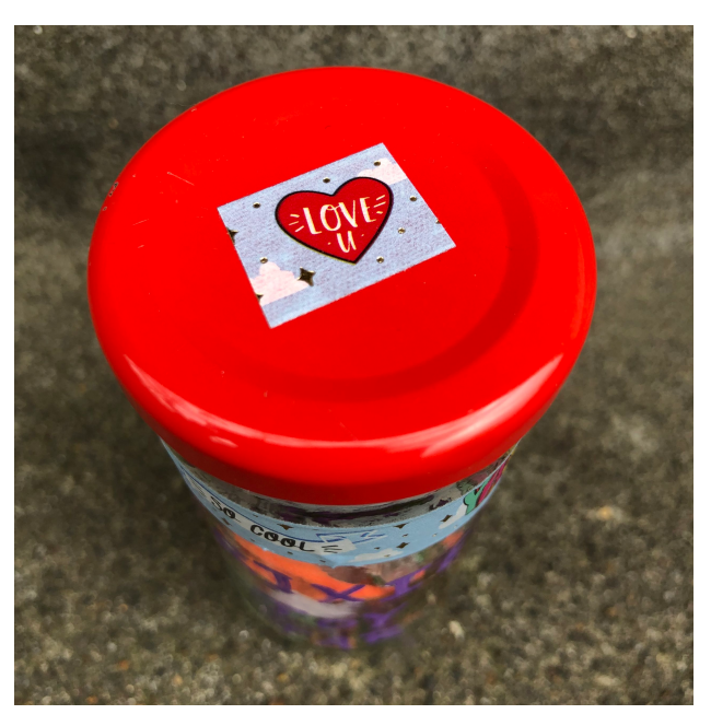
Step 3 of 9

Next, decorate your container. Here are some ideas: