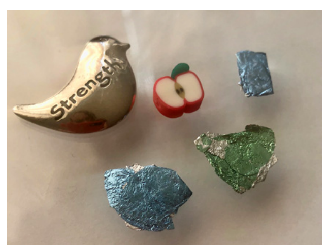
Step 5 of 9

Maybe you have some leftover craft beads. A marble that doesn't have any mates. A really old coin. A sticker from the doctor's office or loose dice or a feather. Basically anything that's not food can be part of your Joy Jar.