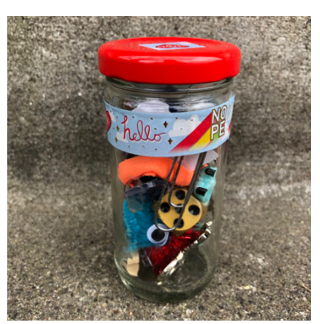
Step 6 of 9

You don't have to figure out a purpose for each thing you collect—not yet. The idea is to pull small things together into a homemade treasure box.