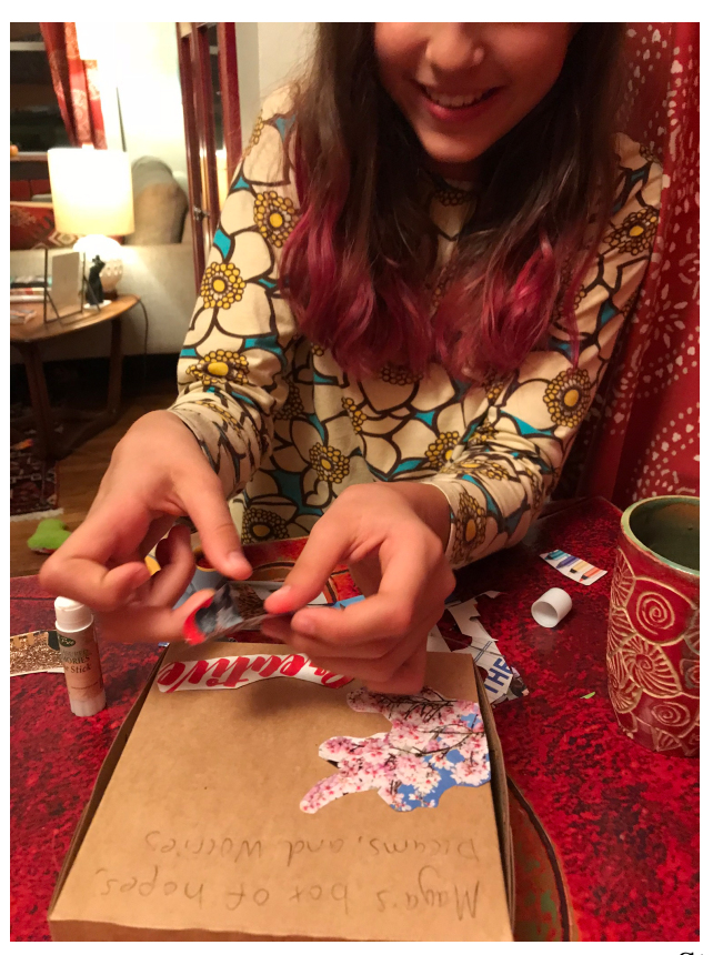
Step 4 of 9