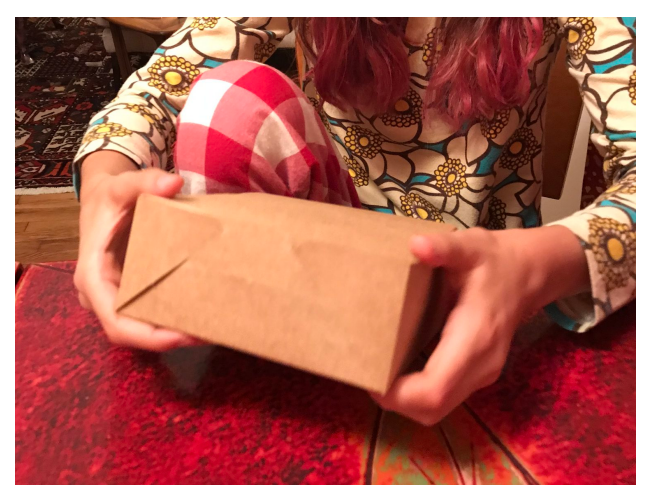
Step 1 of 9

Maybe it's time you let a little of your inside out?