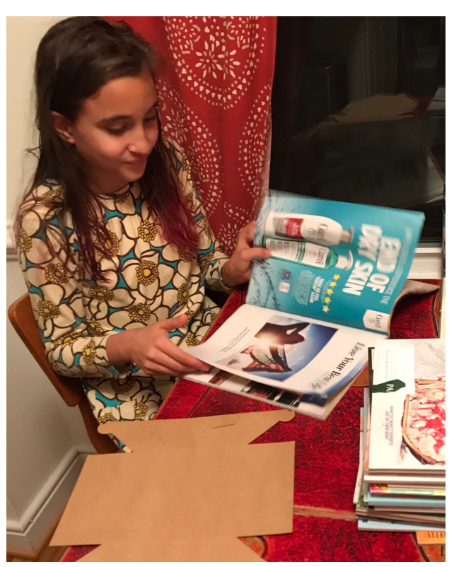
Step 3 of 9

To get started, unfold your cardboard box.